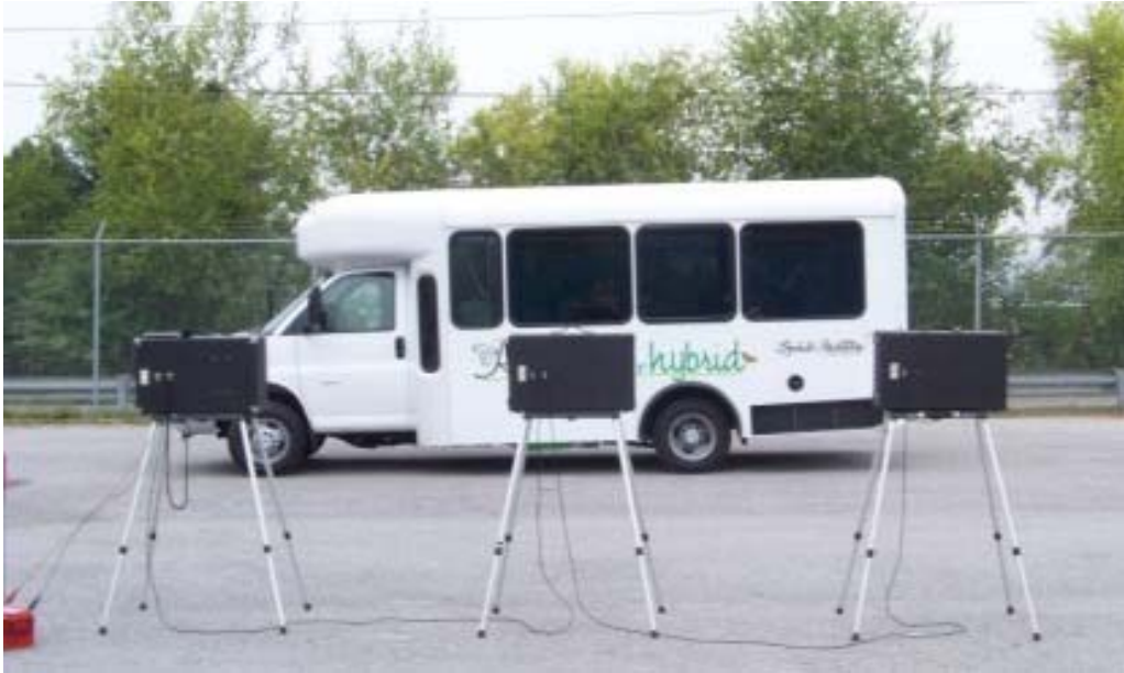
TEST BUS SET-UP FOR 80 dB(A) INTERIOR NOISE TEST