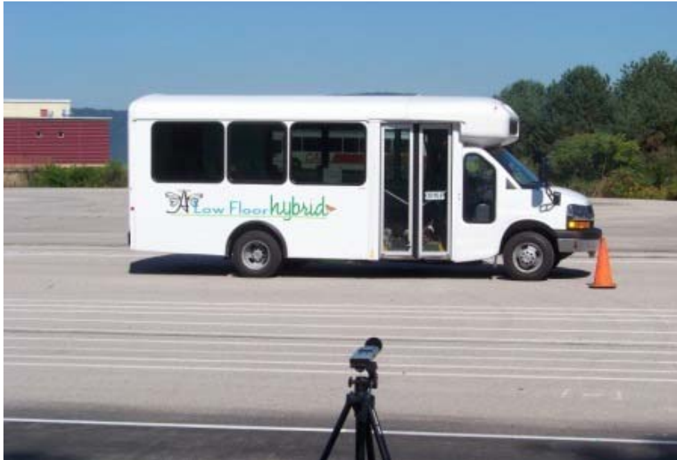
TEST BUS UNDERGOING EXTERIOR NOISE TESTING