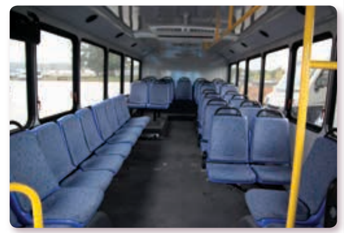
Open low-floor passenger area with no steps, oversize wheelchair positions and weight-reducing technology address key operator concerns.

"This indicates a plus-20 percent fuel economy gain for